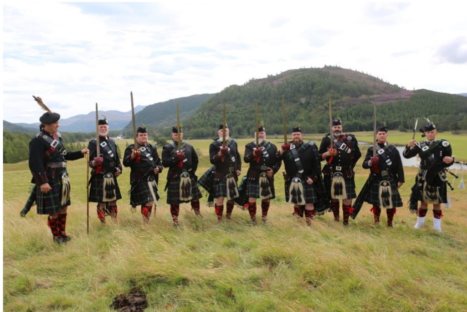
Fig.2 Modern day Invercauld Highlanders (and piper) at the ceremony of oath, August 2022

Another two-year hiatus ensued while the world suffered travel restrictions, social distancing and lockdowns, but after lifting of restrictions the Ballater Games returned for the 2022 season.