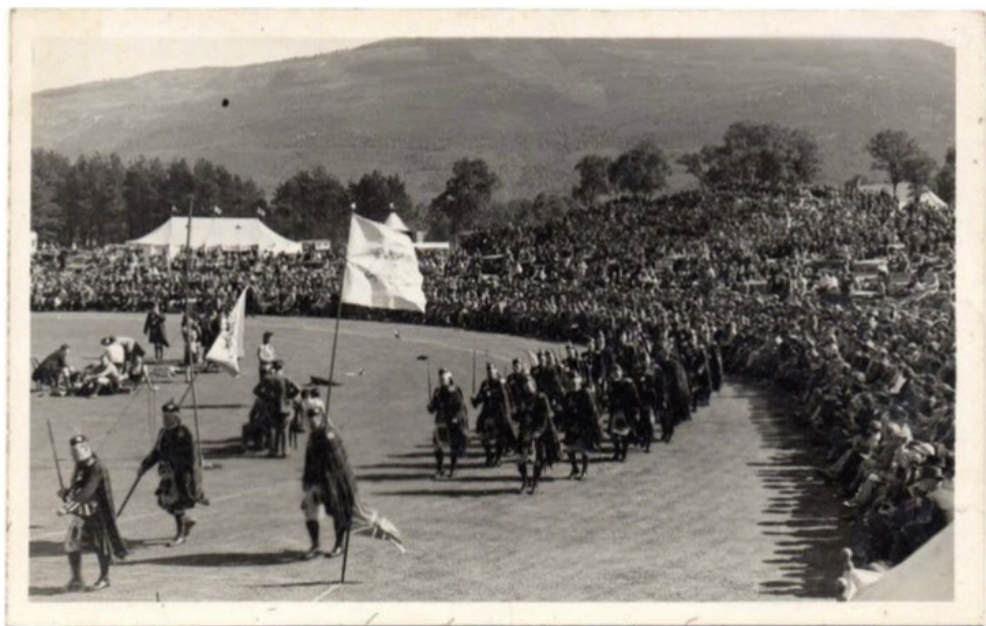
Fig. 1 The Invercauld Highlanders marching in the 1930's

The exact formation date of the Invercauld Highlanders is unknown, but it is believed to have arisen partly from the government-sponsored militias of the 1790's, and partly from the historic tradition of Highland men, fighting under the banner of their Chiefs at national level. Initially they were known as the Farquharson Highlanders, marching under the Farquharson Chief. In the mid-twentieth century this seems to have changed to Invercauld Highlanders. Correspondences of the late eighteenth century show that both the Farquharsons Invercauld and Monaltrie were organizing groups of militia under government sponsorship. Photographs of the early 1900's show lines of Invercauld Highlanders marching at a Highland Games (Fig 1), the twin banners used bearing the Arms of Catherine Farquharson (1774-1845), 11th of Invercauld and Chief of the Clan. The exact date of the name-change from militia to Highlanders most likely took place around 1815, when the Braemar Wright Society was formed, William Farquharson of Monaltrie as its' first President. A group of the Clan Farquharson men marched in front of King George IV on his trip to Edinburgh on August 16th, 1822.